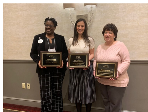
2019 VACTE Awards Banquet