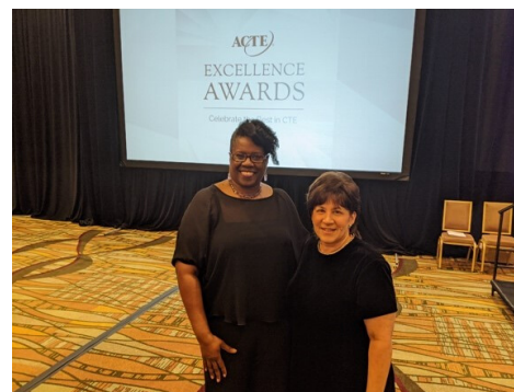
2020 ACTE Excellence Awards Banquet